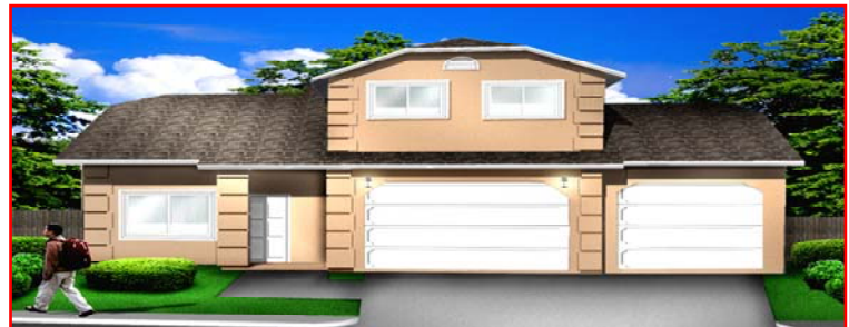
Plan 1897 $ 219,950 5 bedroom * 2.5 bath * 3 car garage