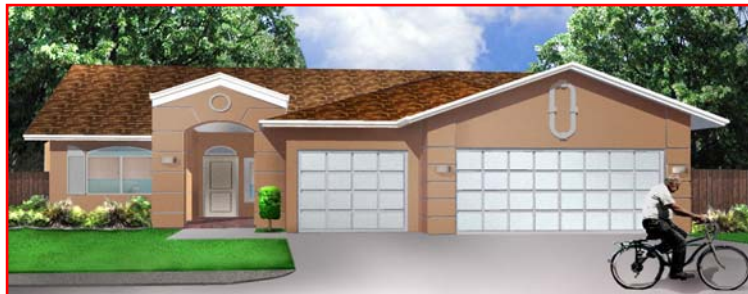
Plan 1670 $ 199,950 4 bedroom * 2 bath * 3 car garage