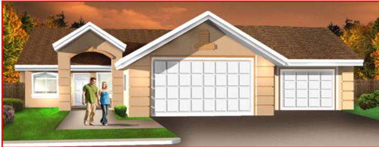
Plan 1440 $ 179,950 4 bedroom * 2 bath * 3 car garage