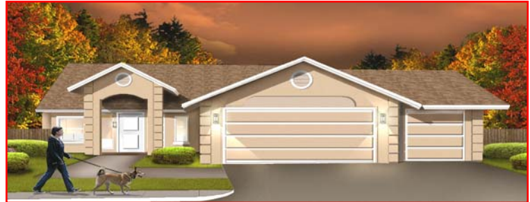
Plan 1620 $ 189,950 4 bedroom * 2 bath * 3 car garage