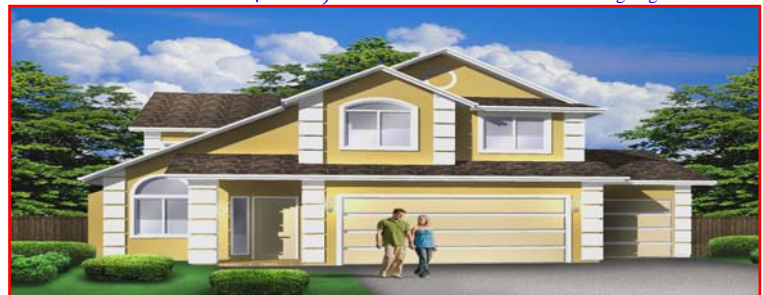
Plan 2408 $ 249,950 4 bedroom * 2.5 bath * 3 car garage