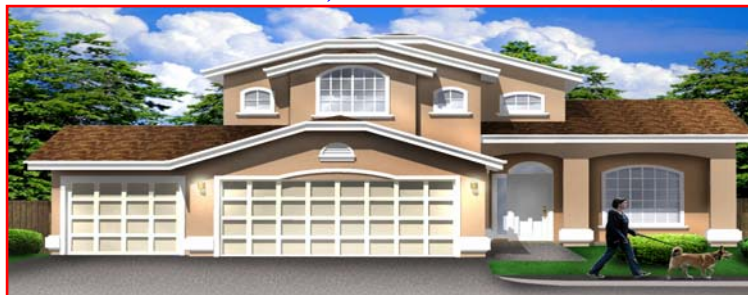
Plan 2239 $ 239,950 5 bedroom * 3 bath * 3 car garage